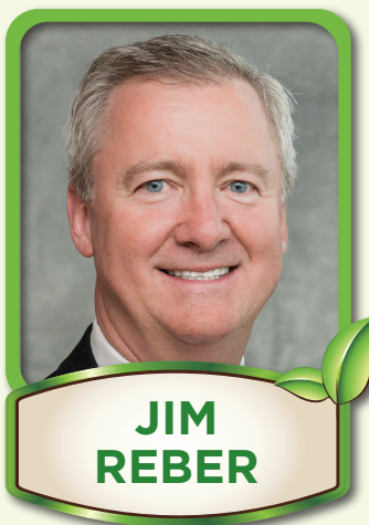
President & CEO ICBA Securities