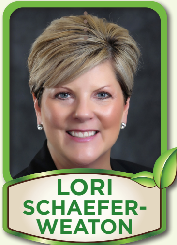
President & CEO Agri-Industrial Plastics Company